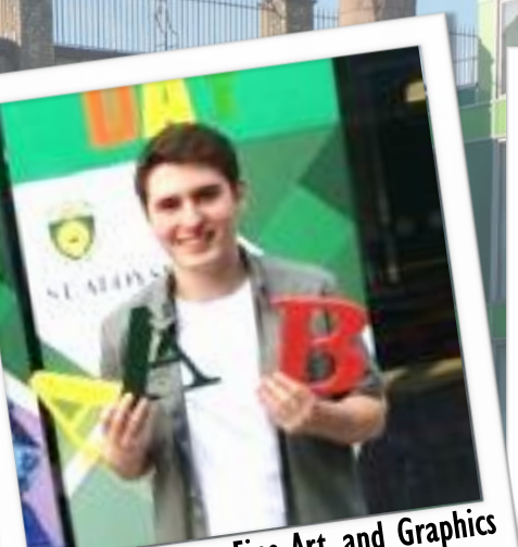
A Levels: History, Fine Art, and Graphics Now: Television and Broadcasting at University of Portsmouth