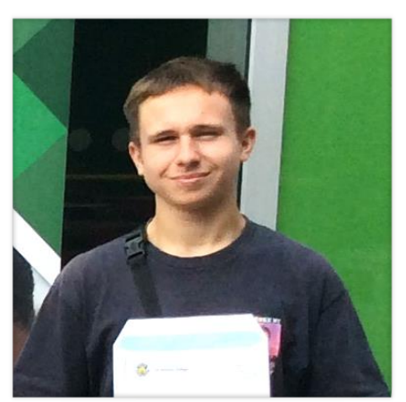
A Level: History, Politics and Psychology Now: Psychology at University of Brighton