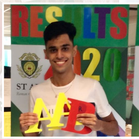
Students were delighted with their grades with many securing exceptional results, including: