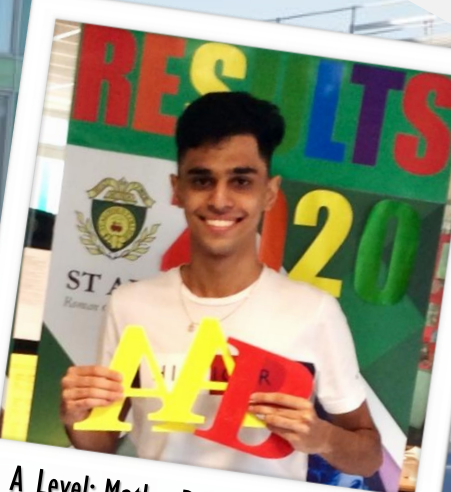
A Level: Maths, Politics and Spanish Now: Law at University of Warwick